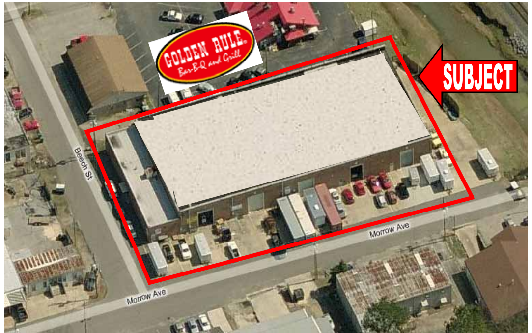
Proforma Income and Expense (contact agent for current numbers)

Ponder Properties Commercial Real Estate 850 Corporate Parkway Suite 106 Birmingham, AL 35242 Phone: 205.408.9911 www.ponderproperties.com